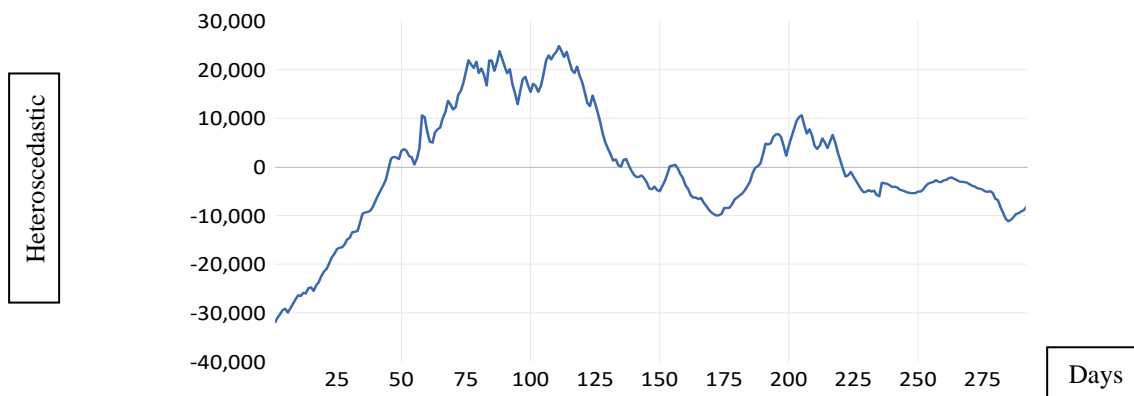
Figure 2- Heteroscedastic disturbance

continue at different intensities after about 75 observations. This figure shows that it is possible to achieve a static condition by detrending in the initial part of the observations (the first 75 observations), but the variance heterogeneity prevents the static regression relationship.